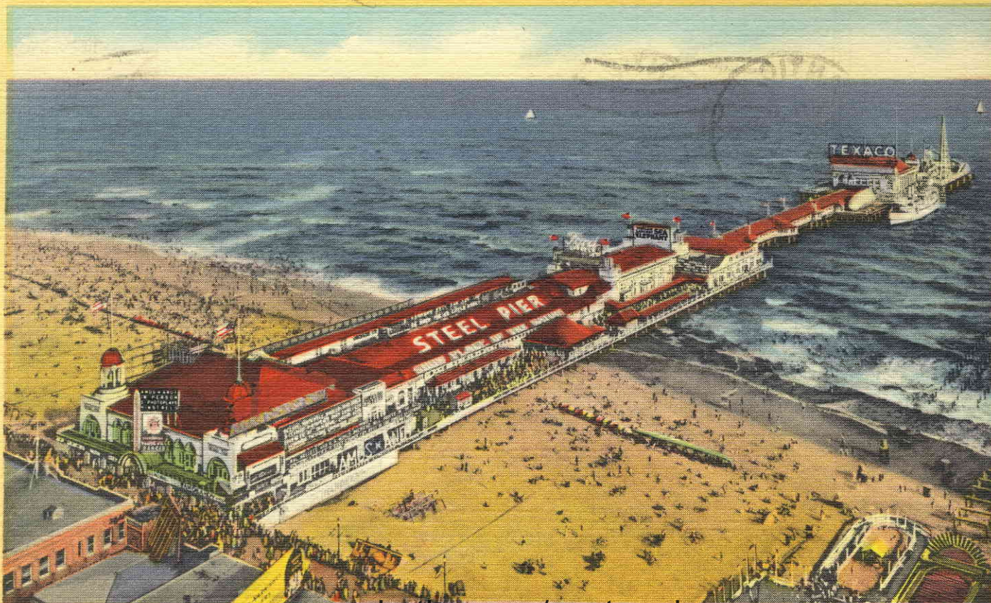
ATLANTIC CITY, N. J.