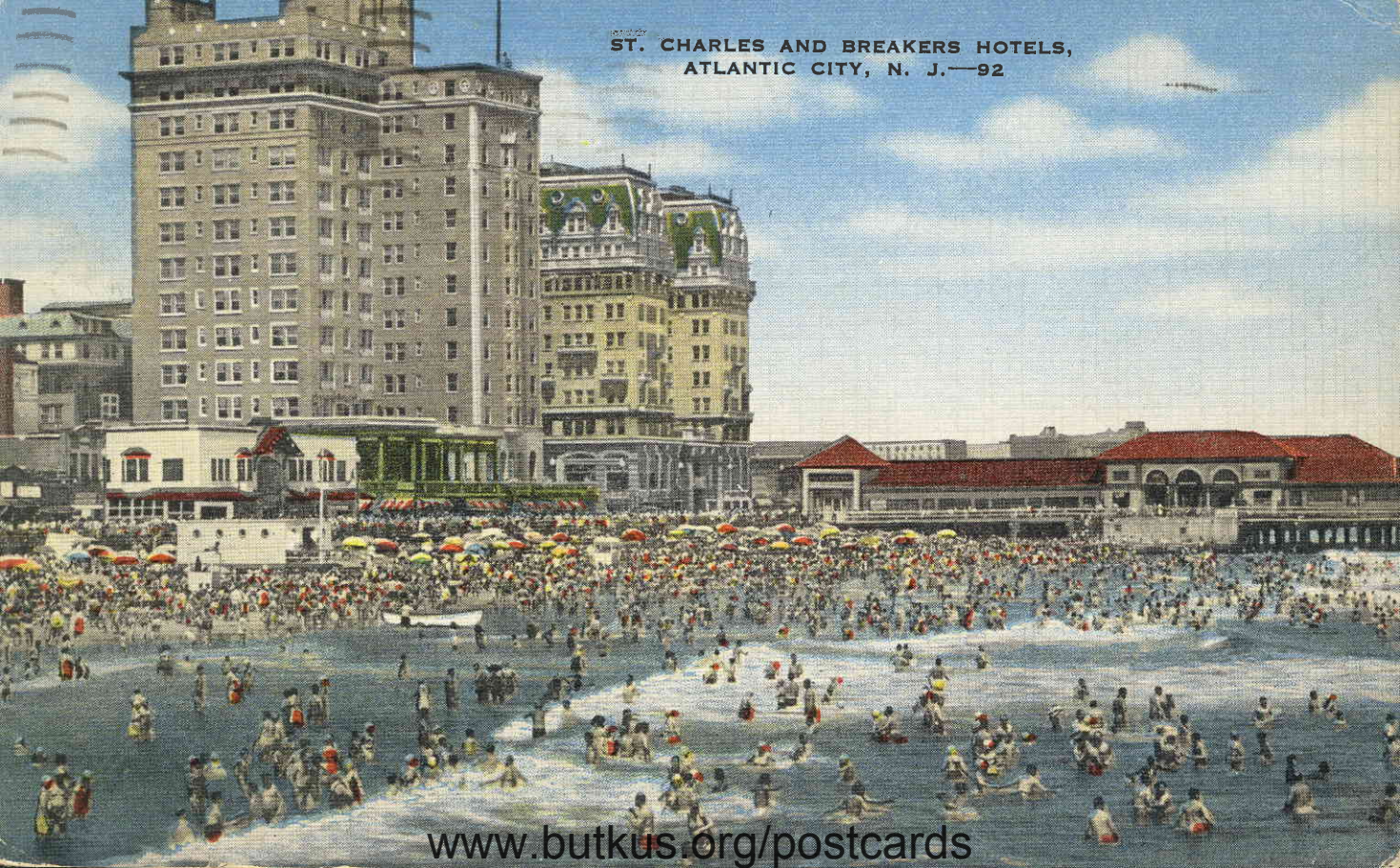
ST. CHARLES AND BREAKERS HOTELS, ATLANTIC CITY, N. J.—92