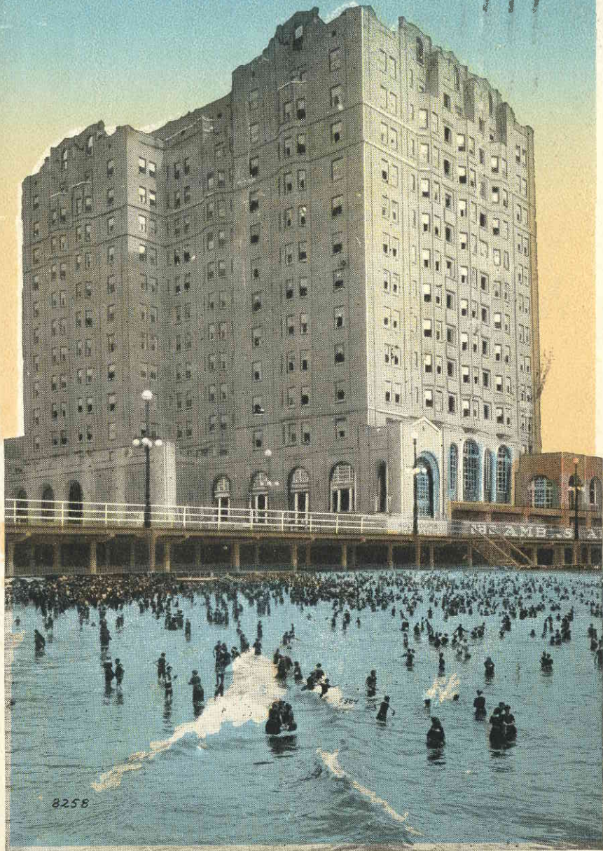
The "Ambassador", Atlantic City, N. J.