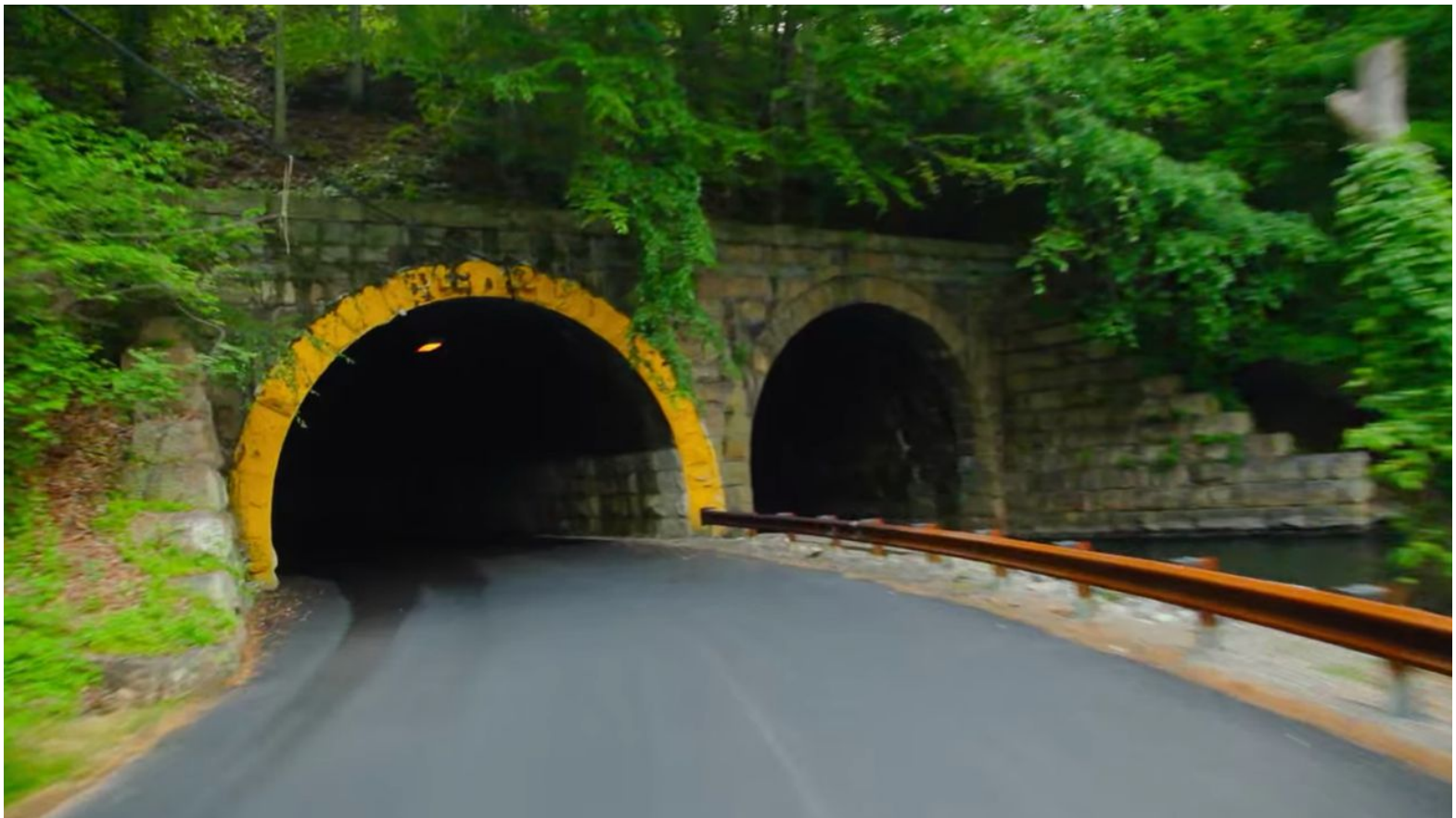
An image of High Bridge's tunnel on Arch Street from Netflix's 'The History of Swear Words.'

Updated Jan 17, 10:00 AM; Posted Jan 17, 10:00 AM