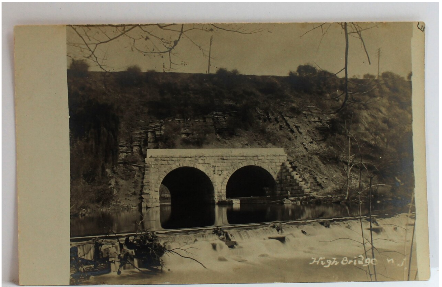
This photo was taken "not long" after the tunnel's completion in the mid-1800s.