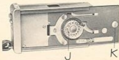
J. Counter Dial K. Operation Plate