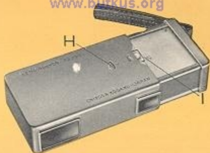
H. Counter Dial Window I. Outer-Case Clasp